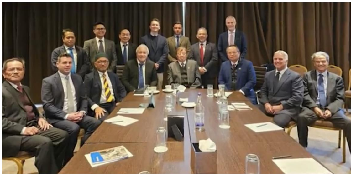
Sarawak Premier, Deputy Premier & State Secretary, Upland Executive 23 rd April 2024, London