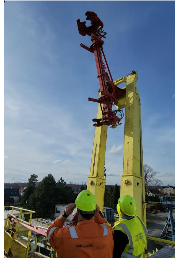
Pictures from Drilling Rig Visit & Inspection on the 26th February 2024 at Sviadnov, Czech Republic. LEFT: Group photo of Upland and Big Oil management team. MIDDLE: View of drilling mast. RIGHT: Demonstration of Automatic Pipe Racking System.